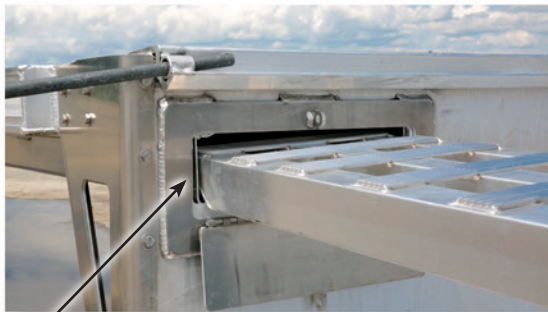
Convenient on-board front ramp storage